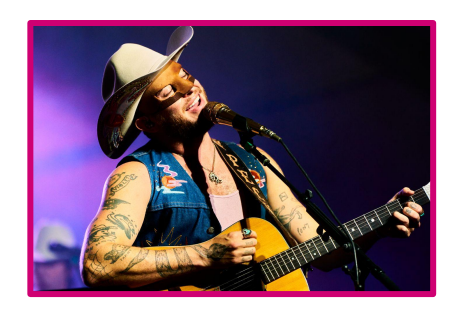
2024 Orville Peck