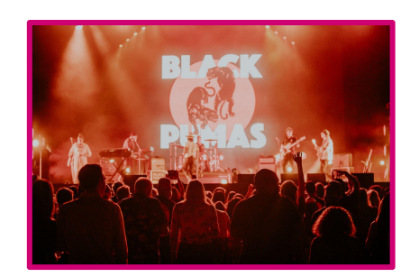
2021 Black Pumas